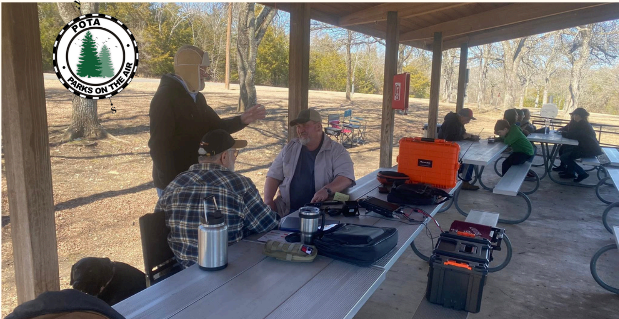
Pictured here are several members activating Eisenhower State Park along with the Texoma Dutch Oven Cookers.

Parks on the Air (POTA) is a popular international amateur radio ("ham radio") program that encourages licensed operators to set up and operate portable stations from designated public parks and protected lands. It promotes emergency communication awareness and outdoor activity, with operators ("activators") making contacts with others ("hunters") to earn awards based on the number of parks or contacts.