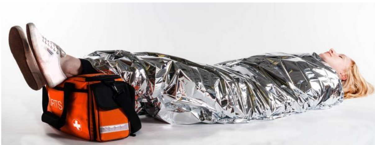
*The shock position

Going into shock necessitates a medical emergency. Shock is when severe blood loss occurs, preventing organs and cells from getting the proper amounts of oxygen. There are a few different symptoms of shock, including blue lips, blue fingernails, excessive sweating, nausea, dizziness, cold or clammy skin, and a loss of consciousness.