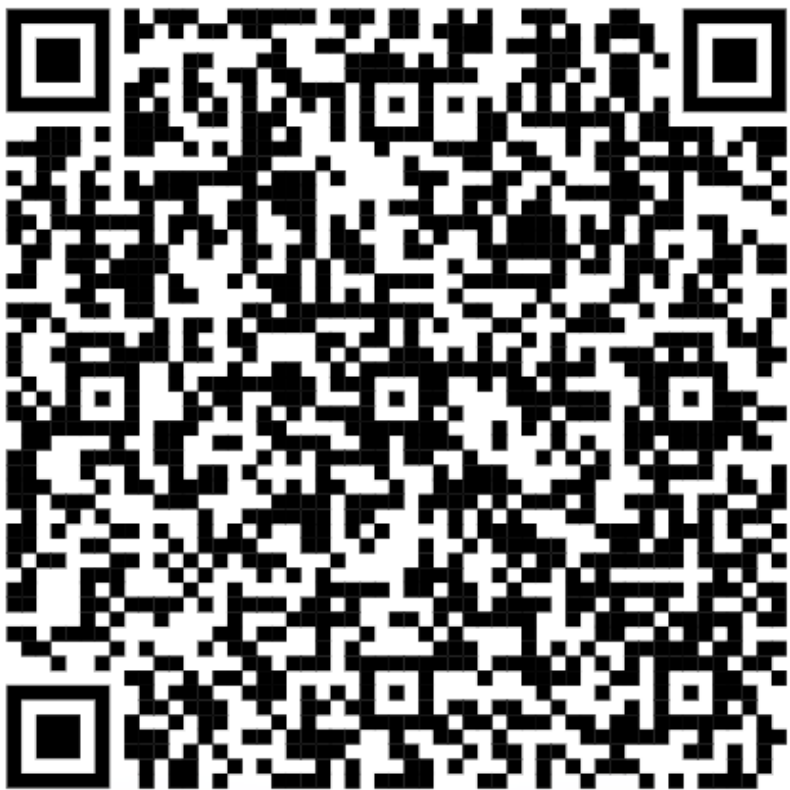
Scan for Report