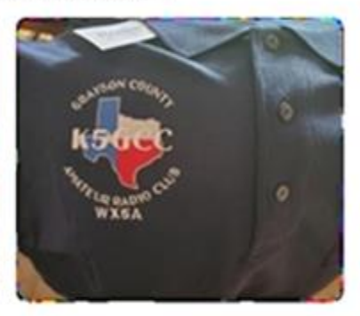
Option 2. Order from the club Treasurer using the form below. Additionally, you can order premade ARES and Skywarn patches for $4.00 each and GCARC Club Patches for $5.00 each.