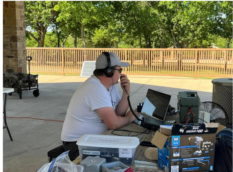
Running some SSB on CW Station