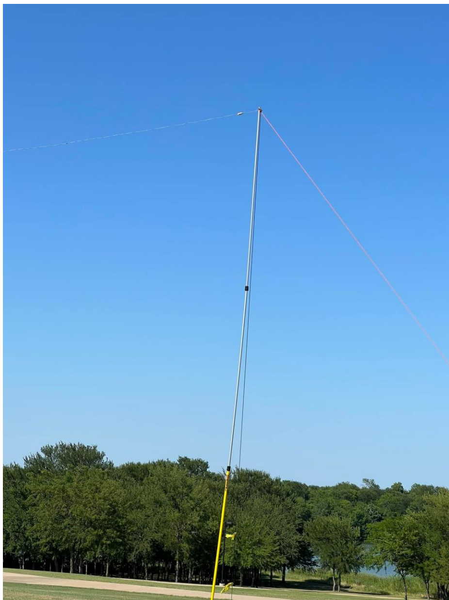
Painters Pole End Fed Inverted Wire