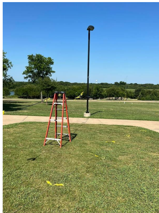
Keeping Coax off the ground using a ladder