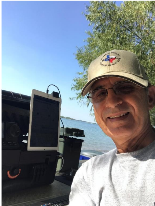
Bonham State Park - selfie