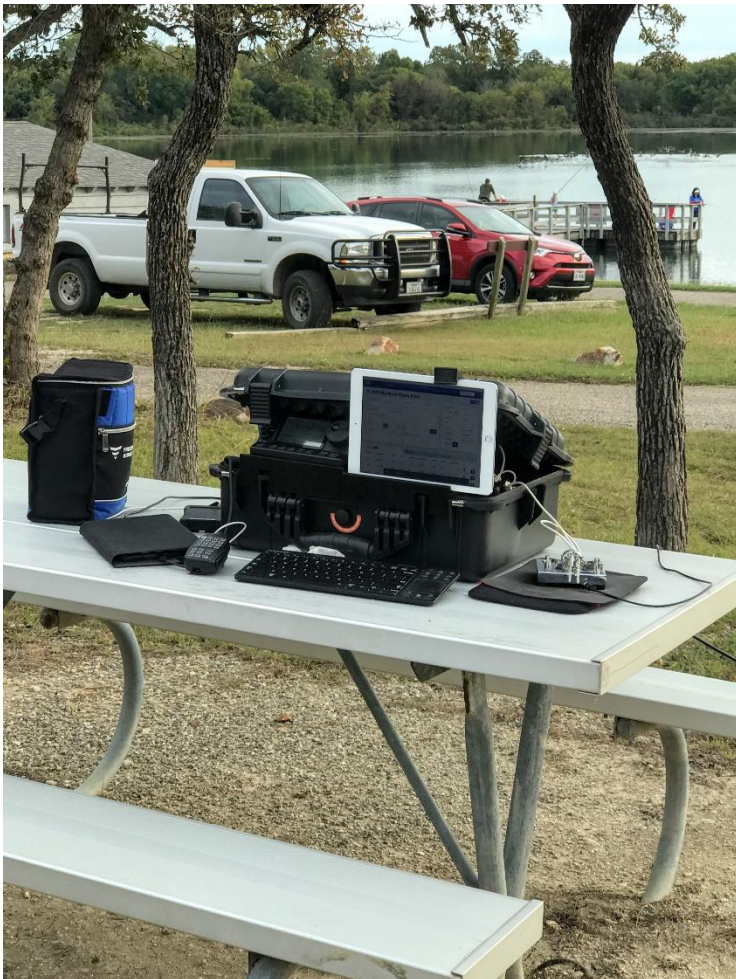
Bonham State Park