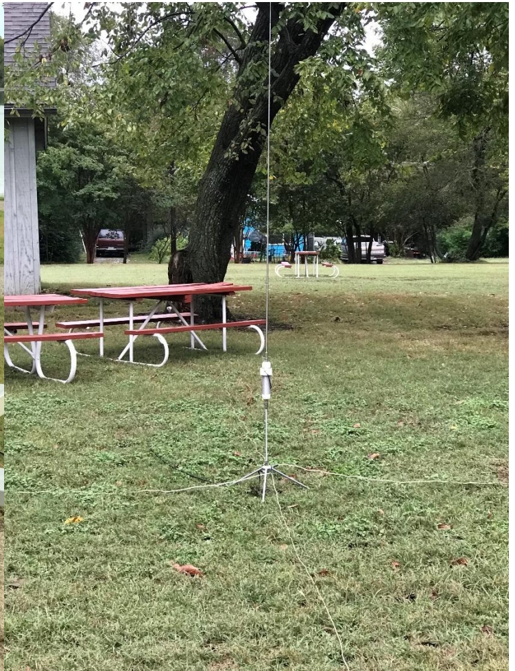
Portable Antenna at the Birthplace used at all outings