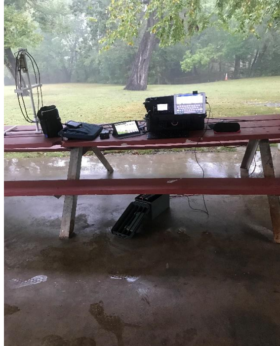
Eisenhower Birthplace (Rainy Day)