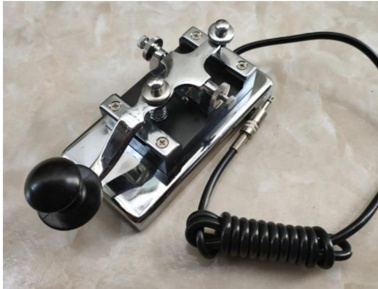
KW5CW Straight Key