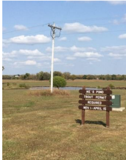
IKE's Pond - No Fish