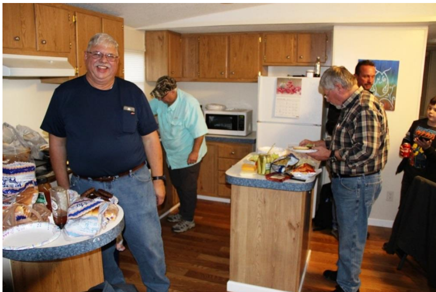
Dinner Time - Thanks to all the Cooks!