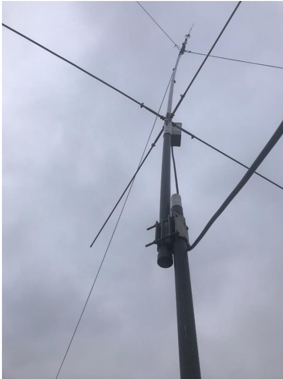
Look at the Club Beast Antenna from ground up