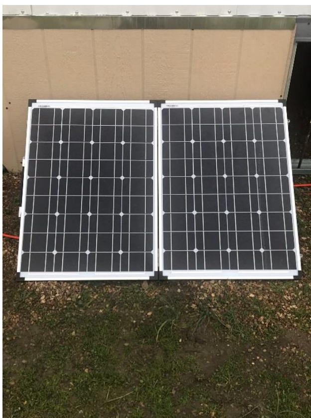
Glens Solar Cells – Close Up..