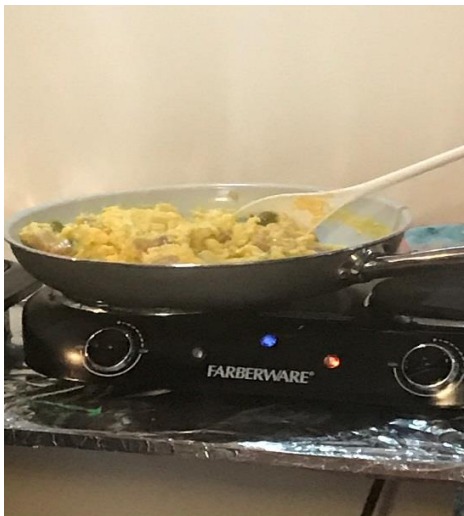
Yummy EGGS! Thanks Doug...