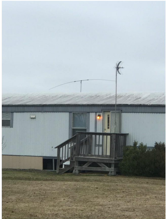
Buddy Pole Behind Hobby House. A second located in front.