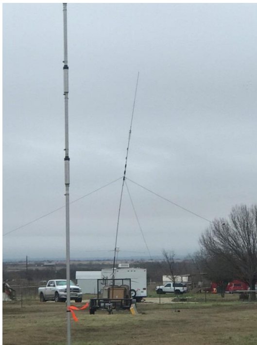
6BTV Forefront - The Tipsy Club 'Beast' Rear