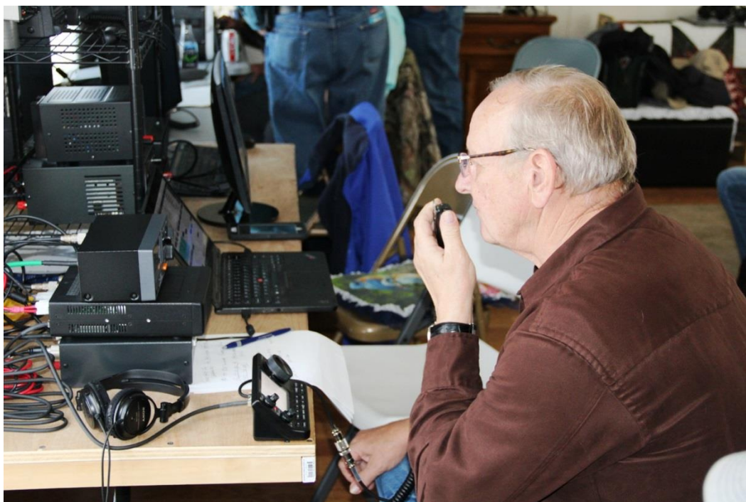
KG5REK(Glen) running IC7100 on SSB (Woops – Where did the logger go?)