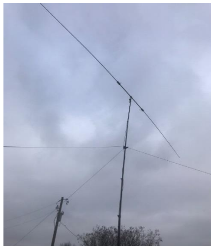
1 of 2 Buddy Poles at WFD